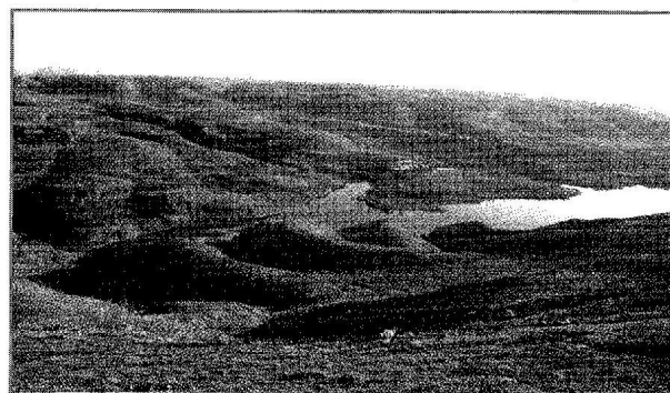
Tall Zar'a from east side of Sad Wadi al-'Arab